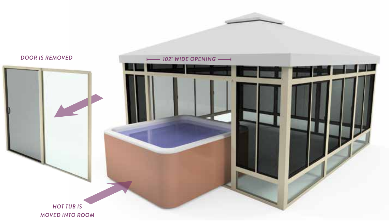
Our 9' <u>Removable</u> Spa Accessible Door makes installation of your hot tub a breeze!

THE LEISURE ROOM'S 9' WIDE DOOR PANEL IS TEMPORARILY REMOVED FOR CONVENIENT HOT TUB INSTALLATION.